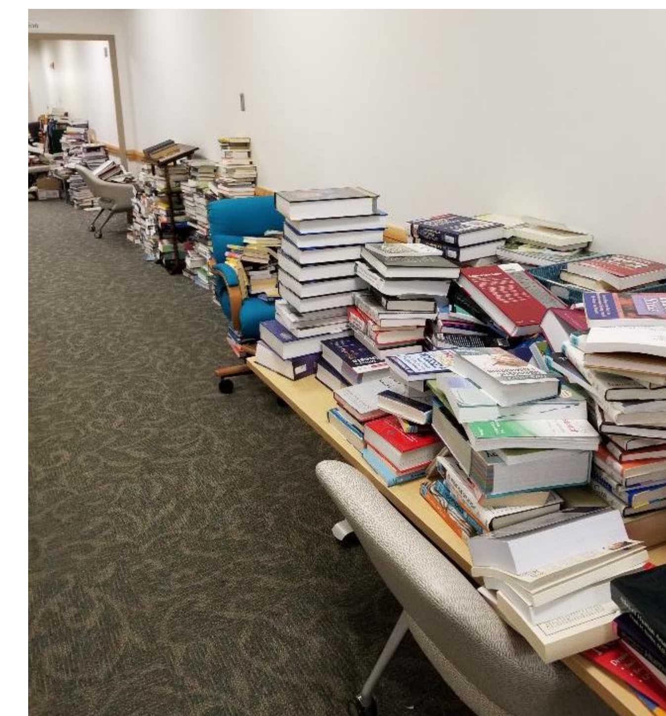
FIGURE 4: Library books and furniture rescued from the flood!