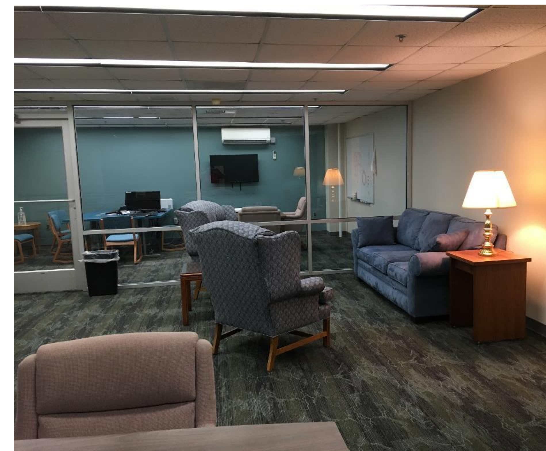
FIGURE 3: New Group Study Space used by Internal Medicine residents for rounds