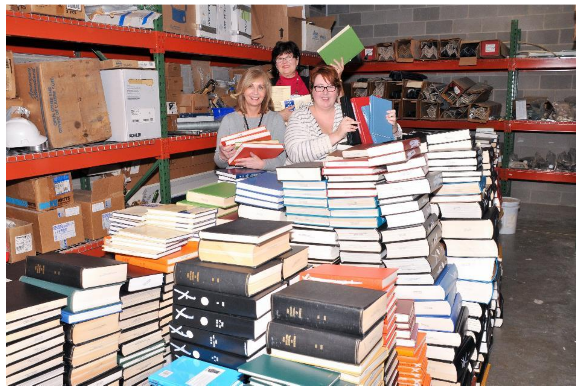
FIGURE 1: Approximately 3.38 tons of paper recycled during the journal weeding project