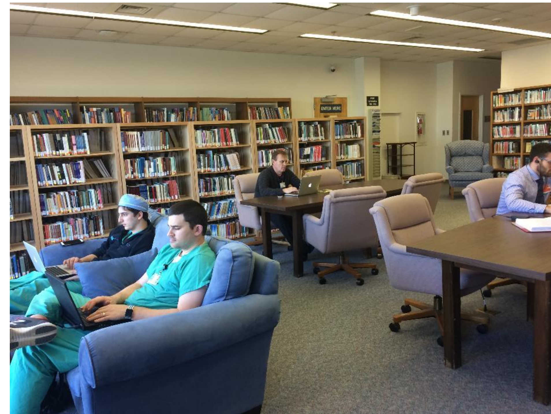
FIGURE 2: SEAHEC Medical Library, Before and After