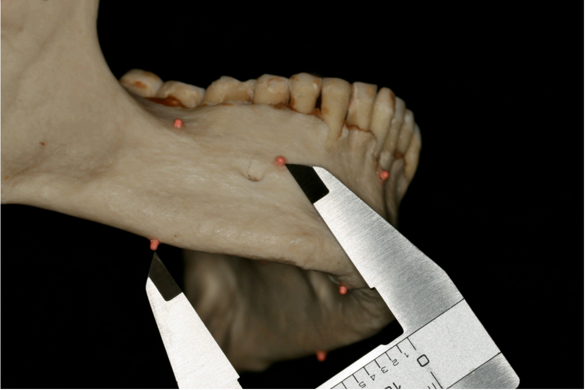
Figure 3-1. Control Measurement (ALD).